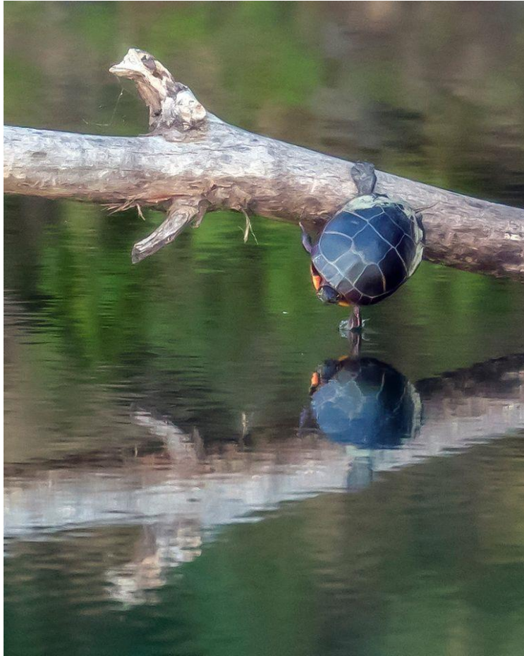
Hang in there, we are fighting the good fight!